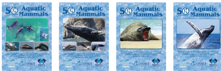
VOL. 49, ISS. 1 VOL. 49, ISS. 2 VOL. 49, ISS. 3 VOL. 49, ISS. 4

ABOUT US AUTHORS ISSUES HISTORICAL PERSPECTIVES SUBSCRIPTIONS CART(0)