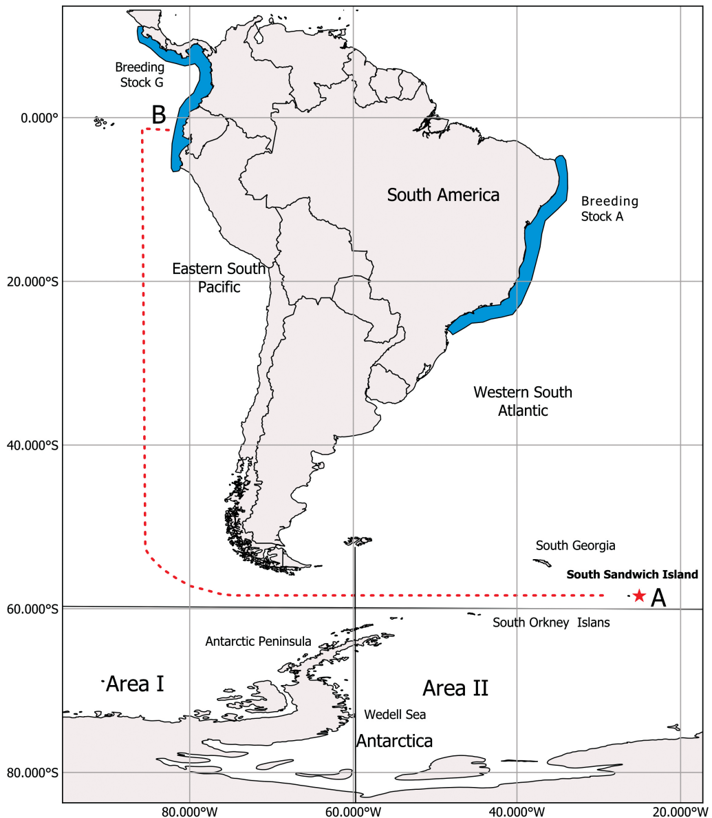
Figure 2. Map of locations where the humpback whale was photographed: (A) 56° 16' S, 027° 32' W off Isla Zavodovski, one of the Sandwich Islands, UK; and (B) 01° 17.333' S, 081° 02.037' W in the marine area of Machalilla National Park, Ecuador. Includes details of Breeding Stocks A and G and Feeding Areas I and II in the Antarctic.

et al., 2021), and poses the question of how and why this overlap may be occurring, as well as its possible implications and effects on population structure.