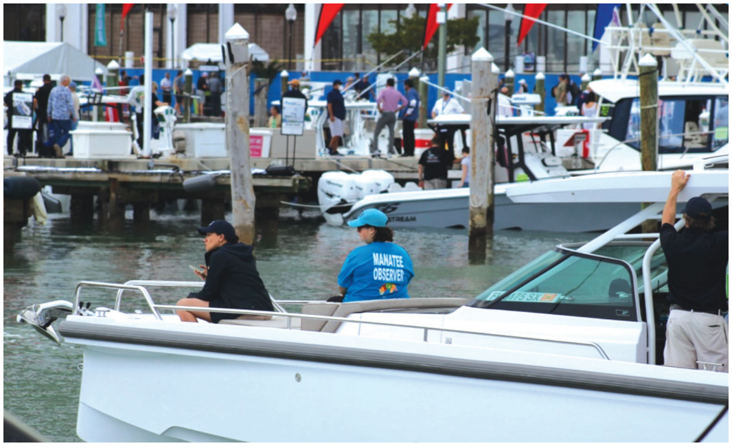
Figure 1. A manatee observer departing on a vessel for a sea trial

Manatee observations, including time, location, and movement, were also recorded on a whiteboard positioned at the observer tent within the marina (Figure 3). Boat show attendees and workers who