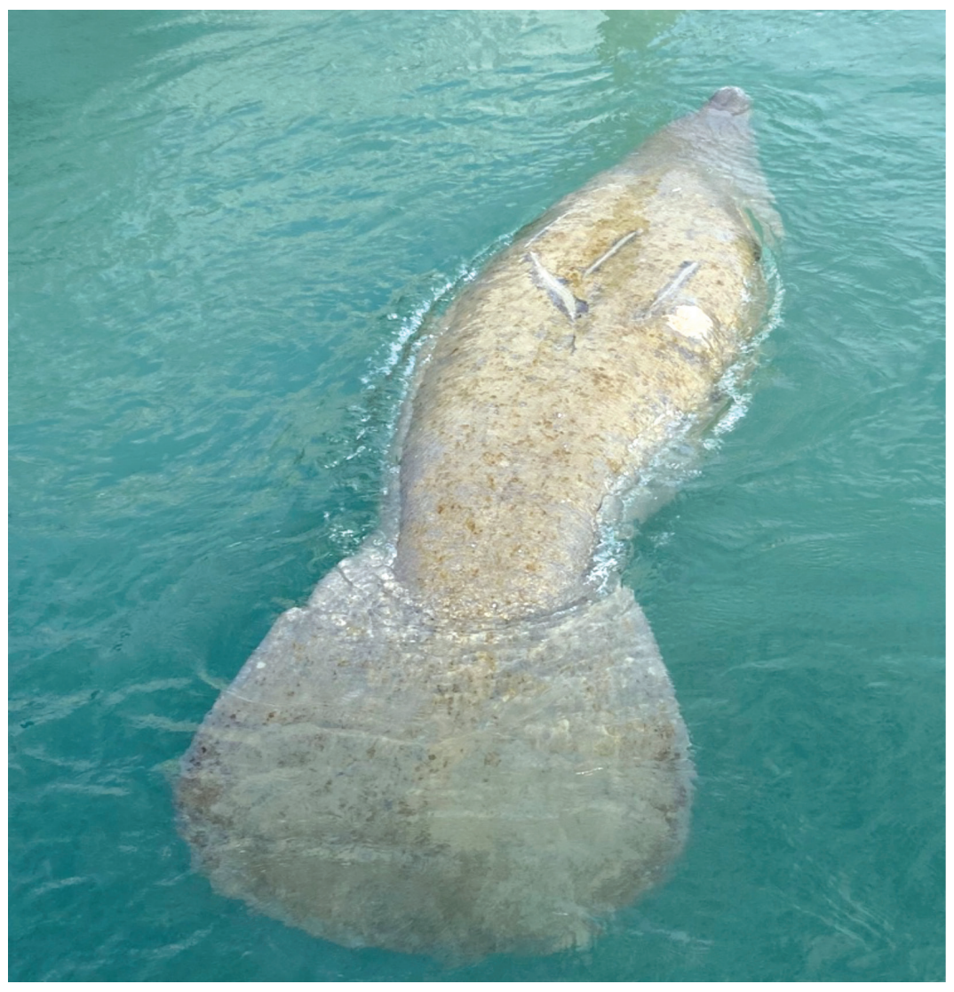
Figure 2. Adult manatee ( Trichechus manatus latirostris ) foraging along the Sea Isle Marina seawall, February 2022

passed by the tent located along the main marina thoroughfare could follow the manatee sightings and ask questions about the animals. This visual information prompted public interest and served as an educational venue. The manatee observation tent also displayed manatee fact placards and the manatee data log used by the observers.