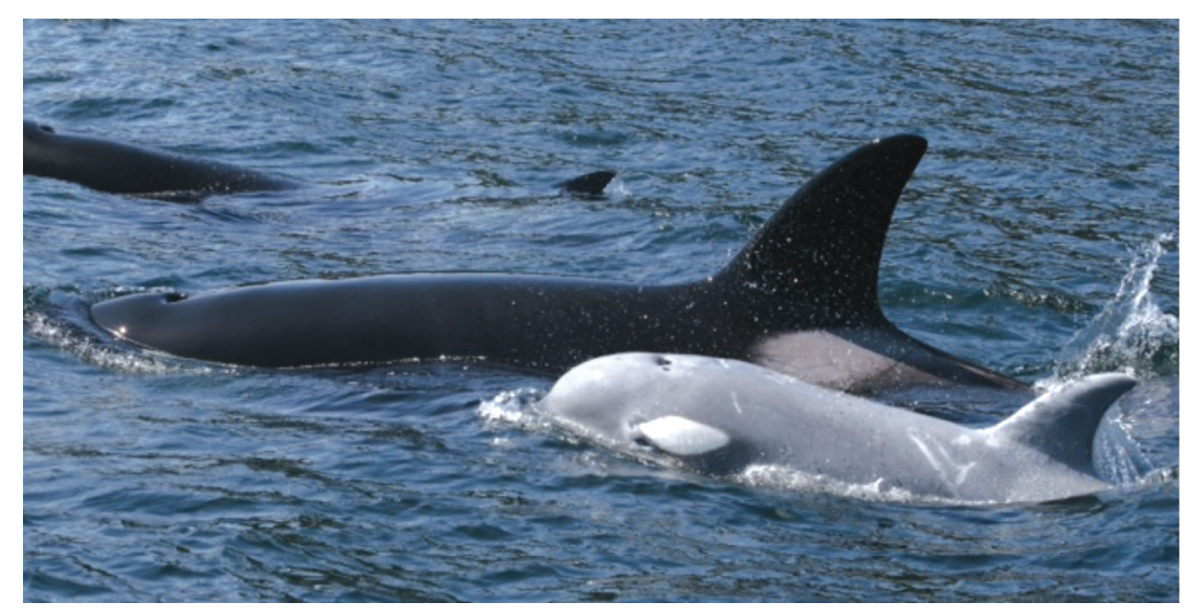
Figure 4. Hypopigmented killer whale ( Orcinus orca ) calf sighted during August 2012 in Juneau, Alaska

presented anomalous coloration and remained close to the adult female, presumably its mother, who displayed normal coloration and was identified as "M5" in the NOAA's killer whale catalogue from the North Pacific (Marilyn Dahlheim, pers. comm., 12 July 2015; Figure 4). The calf's skin was lighter than the other members of the group but not completely white. Similarly, an Atlantic spotted dolphin ( Stenella frontalis ) with lighter coloration but not completely white was reported in Madeira Island, Portugal (Alves et al., 2017).