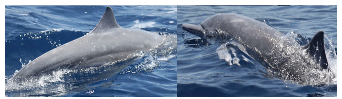
Figure 2. Photographs of the spinner dolphin ( Stenella longirostris ) with a lighter coloration and white patches on both sides of the body. Animal was observed on 25 July 2013 near Cuyutlán Beach in Colima, México.