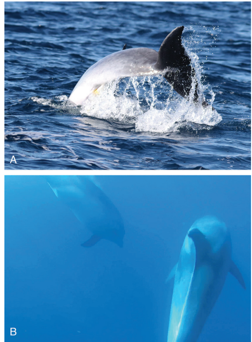
Figure 3. Ventral area of the PA: (A) genital slit and sex (female) visible, and (B) distended abdominal region.

or near the surface, the PA was observed repeatedly nudging the calf's body upwards, even "launching" it out of the water on two occasions (Figure 2A). While diving, the PA used the rostrum to push the body deeper and manipulated it, performing twisting and rolling motions before returning to the surface. The PA displayed this carrying behavior throughout our observation, including when our team left the area, possibly continuing beyond that point. The bystanders displayed a calm behavior, mainly swimming after, alongside, and ahead of the PA at varying distances. PA–bystander interactions were observed