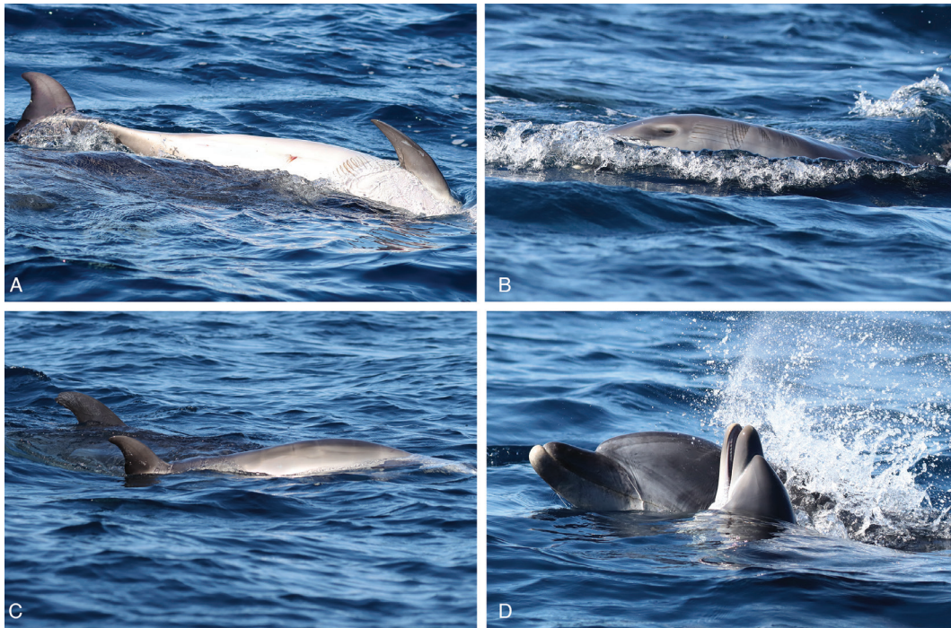
Figure 4. Detailed images of the calf's body: (A) ventral area displaying tooth rake marks and the genital slit (male), (B) tooth rake marks on the flank, (C) visible fetal folds, and (D) visible lower jaw with no erupted teeth and without rostral whiskers.

during which the genital tract remains extended after delivery (Sheldon, 2004; Noakes, 2009). Considering this, along with the estimated age of the dead calf, the observed female was likely its mother. Motherhood in cetaceans is characterized by an intense dedication towards the dependent offspring (Mann, 2018; Rendell et al., 2019), particularly so for bottlenose dolphins in which the connection between mother and infant can persist for up to 11 y (Triossi et al., 1998). The loss of offspring is therefore expected to induce physical and emotional responses in these animals.