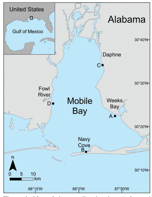
Figure 1. Map of the stranding locations (referenced in the text and in Table 1) of the sperm whale ( Physeter macrocephalus ) in Mobile Bay, Alabama

Day 3—The whale moved out of sight of boatbased monitoring crews overnight, and search efforts to relocate the whale resumed early on 21 November 2020. Due to the potential for active movement by the animal and distance between previous stranding locations, ALMMSN requested aerial support to increase search capacity. On-water and aerial search efforts, aided by ADCNR and the U.S. Coast Guard (USCG), were unsuccessful in locating the whale.