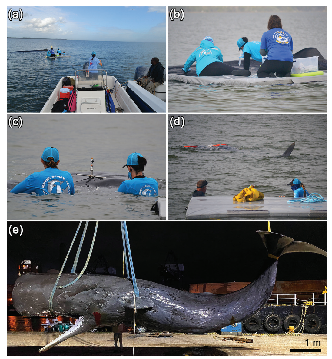
Figure 2. Assessment, euthanasia, and transport of the sperm whale stranded in Alabama: (a) Initial assessment from a floating mat connected by a line to a response boat on day of euthanasia; (b) intramuscular sedation; (c) placement of large whale euthanasia needle, shown immediately post-euthanasia; (d) preparation for postmortem transport showing the sling (yellow) and line (blue) used for towing; two orange ring buoys demarcate the whale, and the fluke is visible above the water; and (e) postmortem view of the whale showing placement of sling and lines to lift the animal from the water using a crane.

before being lifted into a semi-end dump trailer for transport (~0.25 km) to a privately owned location for necropsy.