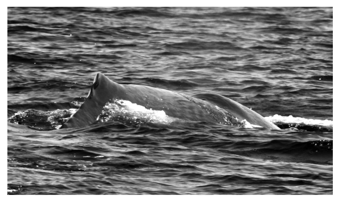
Figure 3. Sperm whale in the Azores on 23 August 2017 with a photo-ID match from the Gulf of Mexico in 2002. The whale is thought to be a male due to its size, presence of a bulge on the head, and lack of a callus on the dorsal fin.