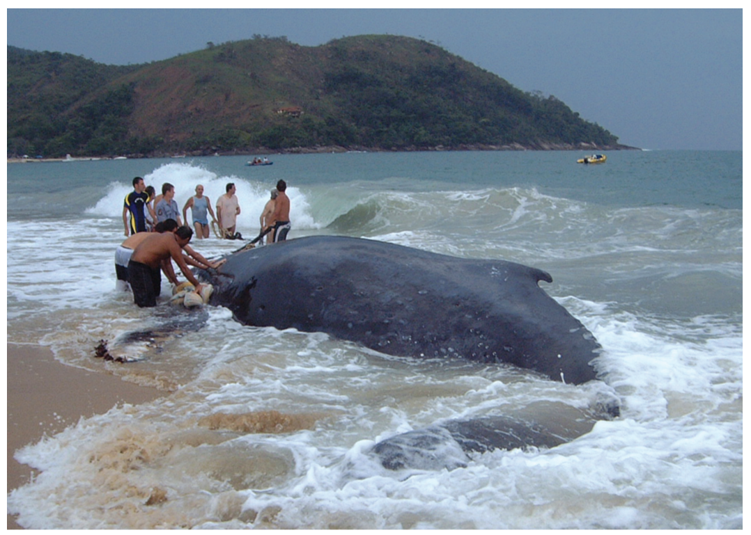
Figure 3. Refloating operation showing posterior region of the pectoral fins protected by cushions

The program also calculates the probability of identity statistics P(m), which is the probability that two individuals within the population share the same multilocus genotype by chance, using the Hardy–Weinberg HW P(m) formulation and a more conservative measure, the Sib P(m). The lower the P(m) value, the higher the loci power to discriminate individuals. Thus, our dataset with 10 loci enabled accurate individual identifications, with the HW P(m) of 2.30 × 10-12, and the most conservative measure, Sib P(m), of 9.26 × 10-5. Finally, the two samples had identical genotypes and sex assignment, and, therefore, can be confidently assumed to represent the same individual.