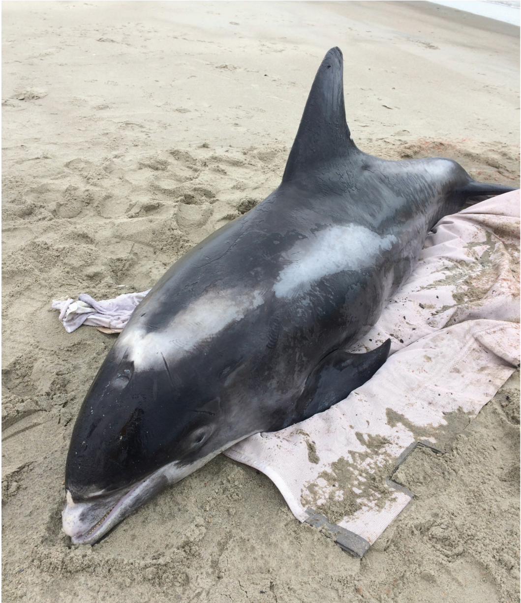
Figure 3. Stranded white-beaked dolphin in Beaufort, North Carolina, on 16 April 2015

The carcass was loaded onto the vessel Spyhop and taken to the chiller (3° C) at NC State University CMAST in Morehead City for over-night storage. A detailed necropsy commenced 15 h after death.