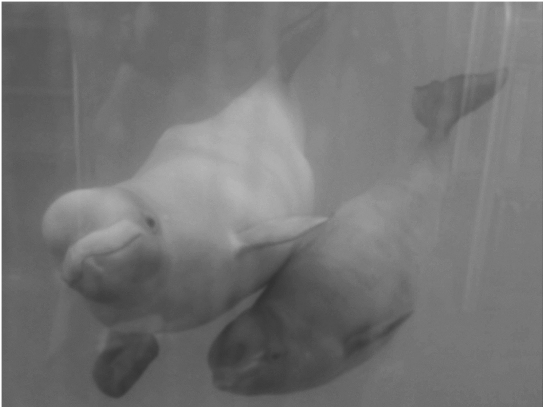
Figure 1. Mother–calf dorsal-to-ventral contact as calf moves from infant position