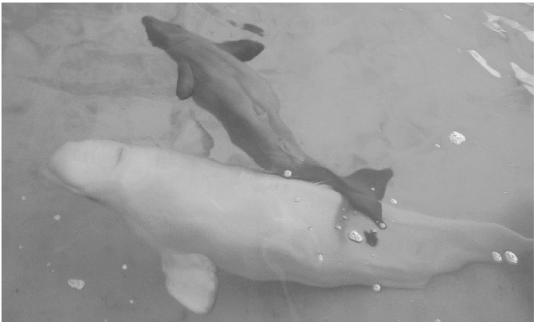
Figure 2. Picture of fluke-to-body social contact initiated by a calf toward his mother (referred to in Table 1)