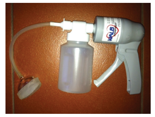
Figure 2. Mammary (breast) pump developed by Walb for dolphin application