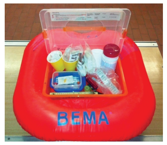
Figure 1. A floating device to contain items required for intervention and care