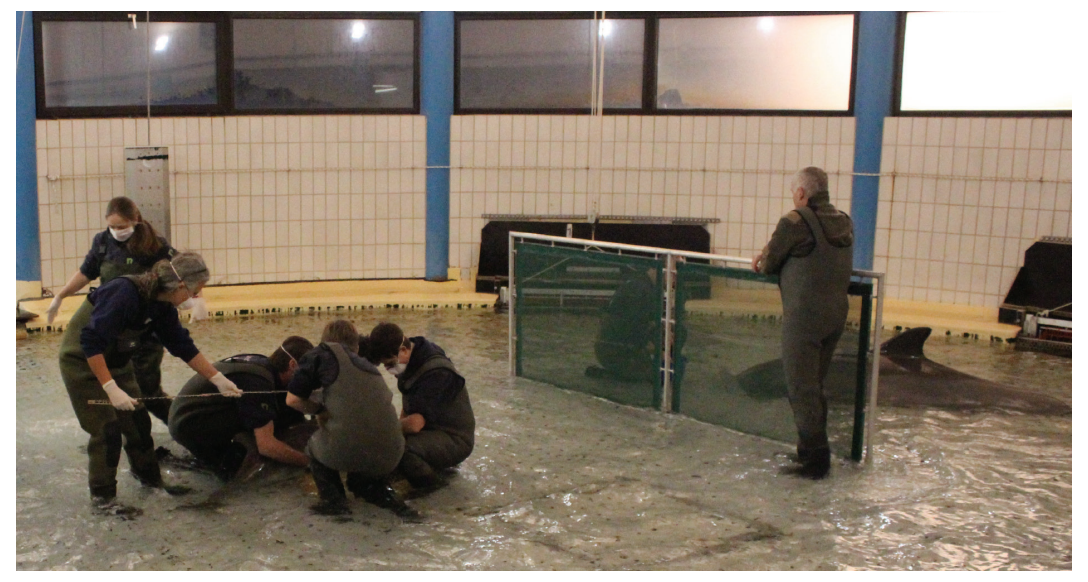
Figure 3. Separation walls between mom and calf, if needed