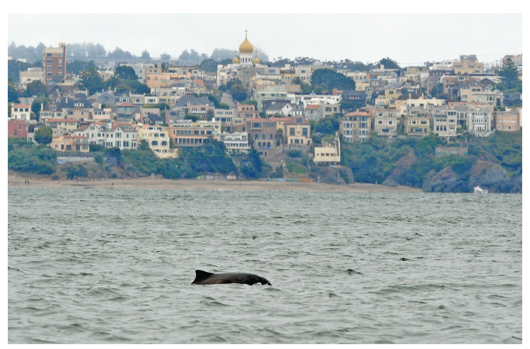
Figure 2. Harbor porpoise in San Francisco Bay, December 2010. The gold domes in the background belong to the Russian Orthodox cathedral.