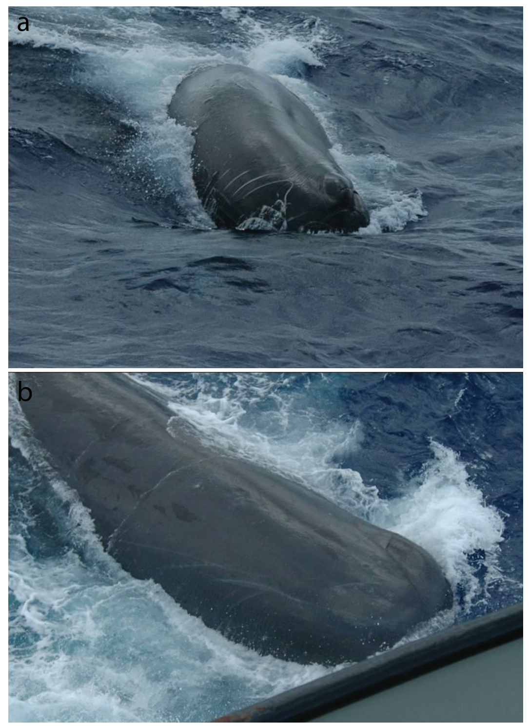
Figure 2. (a) Whale A, the individual that collided with the survey ship; notice the fresh equidistant scars to the left of the blowhole. (b) Whale A just prior to impact; the ship's rail is seen in the foreground.