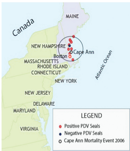
Figure 2. Map of the northeast U.S. showing the significant spatiotemporal cluster of PDV cases from 1 July to 31 October 2006. The red circles represent the stranding location for positive PDV cases ( n = 10 ), and the blue circle represents a negative case ( n = 1 ). The circle with a star identifies the location of the marine mammal unusual mortality event (MMUME) declared by the National Oceanic Atmospheric Administration on 20 October 2006. The black circle shows the diameter of 213.5-km spatiotemporal cluster of PDV positive cases.

*Prevalence significantly different between time periods