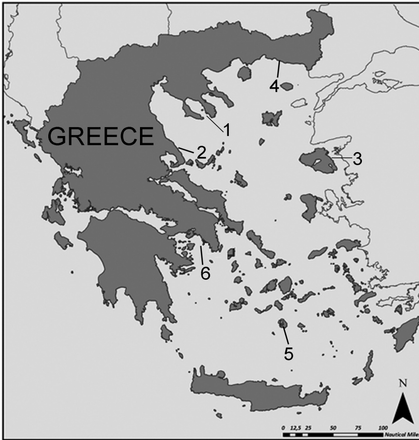
Figure 1. Map of Greece indicating the locations where Mediterranean monk seals ( Monachus monachus ) were observed sleeping; numbers 1 through 6 indicate the locations for each observation included in this paper.

Dendrinos, 2011). Relatively little is known about the behaviour of the species at sea. Herein, six observations of monk seals sleeping at sea are reported, and the importance of understanding their behaviour to shape the conservation strategy for the Mediterranean monk seal in Greece is evaluated. All observations were made between 2011 and 2016, either directly by our research group or by speargun fishermen who provided video footage, which we then analyzed (video footage is available on the Aquatic Mammals website: www.aquaticmammals-journal.org/index.php?option=com_content&view=article&id=10&Itemid=147 ). In the observations where video footage was provided by speargun fishermen, follow-up interviews were conducted to collect additional information regarding the circumstances surrounding each observation.