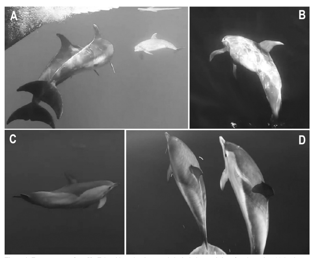
Figure 1. Frame captures from YouTube videos showing morphological characteristics of each species: (a) bottlenose dolphin ( Tursiops truncatus ), (b) Risso's dolphin ( Grampus griseus ), (c) common dolphin ( Delphinus delphis ), and (d) striped dolphin ( Stenella coeruleoalba )

had any significant effect on species identification success.