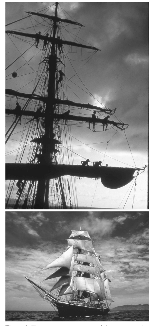
Figure 2. The Regina Maris , queen of the sea, a wooden hull, three-mast barquentine built in 1908 in Denmark, served as a sail training ship and a whale research vessel for the Ocean Research and Education Society, Boston, from 1975 to 1986.

from atop the royal yard or photographing them from the bowsprit. We contributed 1,356 humpback fluke ID photographs to the North Atlantic catalogue, increasing it ten-fold at the time. We published the first mark-recapture estimates of the western North Atlantic humpback whale population (Balcomb & Nichols, 1982), and a historical summary of the North Atlantic humpback whale research in the West Indies is in preparation by Kennedy et al.