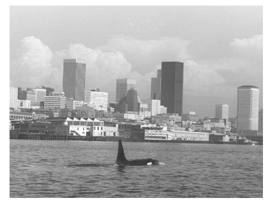
Figure 4. A southern resident killer whale (J3 – adult male SRKW) cruising the Seattle waterfront in 1976, the first year of the "Orca Survey"

Over the years, my own perspective has changed as a direct result of getting to know many whales "individually"—from Taku (K1, SRKW, O. orca ), to Humphrey (wayward Pacific M. novaeangliae ), to the healthy but disoriented BMMS 00-03 ( Z. cavirostris ) that I pushed back to sea in the