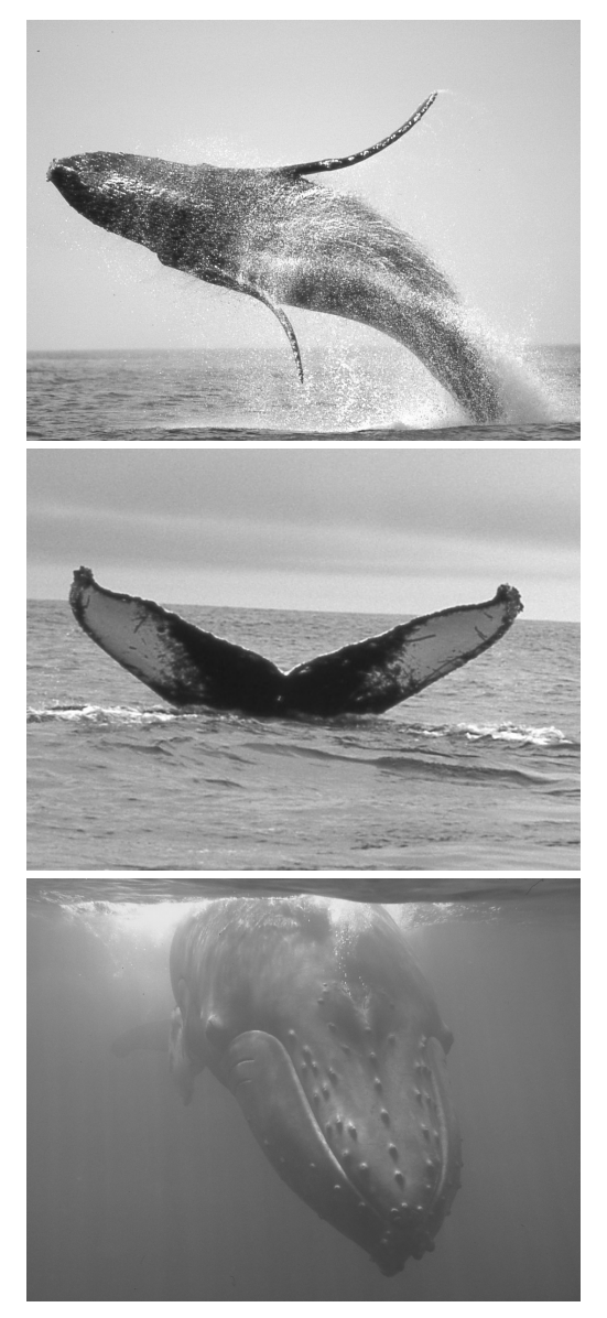
Figure 5. Various humpback whale friends; the breach was an anonymous whale in Banderas Bay, Mexico; the fluke photo is of "Humphrey," the famous whale that swam up the Sacramento River before being escorted back to San Francisco Bay and the Pacific Ocean; and the underwater photo is of "Batik," who played around Regina Maris on Silver Bank, acting like she remembered us from Massachusetts Bay.

Bahamas when my "scientific" instincts were to try to keep it captive in a lagoon for study. At that very moment, the whale was another being with a life of its own to live, and a will to do so, not mine to take for science or experiment. Keiko,