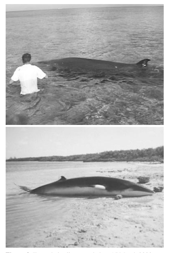
Figure 3. Two whales live stranded on 15 March 2000 as a result of a U.S. Navy sonar exercise in the New Providence Channel, Bahamas. Top: Cuvier's beaked whale (BMMS 00-03); Bottom: a Minke whale (BMMS 00-12).

On 15 March 2000, the first day of one of our Bahamas Earthwatch Teams, an event occurred that literally blew everything apart: 17 whales, many from our catalogue population, live stranded almost simultaneously along 60 miles of northern Bahamas bank and island shoreline; many inexplicably died within hours (Figure 3). I had previously attended several mass strandings of cetaceans, and I had witnessed oikomi cetacean drives in Japan. In those events, the subjects died or were euthanized/killed over a time period of daysnot dying within hours or less as in the Bahamas incident. I had read about a similar mass stranding of beaked whales that occurred in Kyparissiakos Gulf, Greece, in 1996, that was associated with NATO military testing MF and LFAS sonar equipment (D'Amico, 1998; Frantzis, 1998). I had calculated (based upon my Naval experience) that the received level of these sonars at the whales was well below the 180 dB re: 1 µPa RL considered safe exposure. The big question at the time was, "Can sonar kill whales? If so, how?"