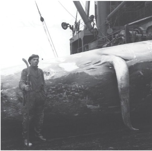
Figure 1. Nipple grooves behind the penis of whale SH886 (Blue ♂, 23.9 m long) in 63° 51' S, 78° 53' E, 26 January 1948