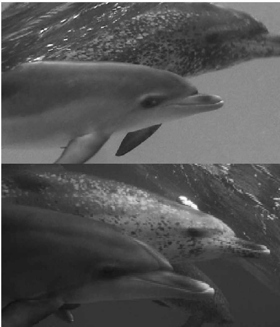
Figure 2. Top photo shows the hybrid calf with his adult (fused) spotted dolphin mother from GBB. Especially striking is the shorter rostrum of the hybrid calf. Bottom photo depicts a normal spotted dolphin calf with an adult (fused) spotted dolphin mother from LBB.

observed on GBB, with the exception of nocturnal feeding behaviour in deep water (Herzing & Brunnick, unpublished data). However, this is likely due to our lack of ability to do nocturnal work on GBB because of harsh weather conditions in the winter. The parallel observation of bottom foraging activity in the two locations is not surprising, considering the similar habitats and bottom ecology (both are western edges of the sandbanks juxtaposed to the deep waters of the Gulf Stream).