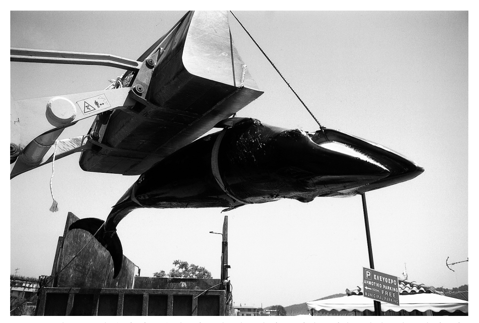
Figure 2. Photograph (23/05/2000) showing the dorsal view of the minke whale taken during its transportation.