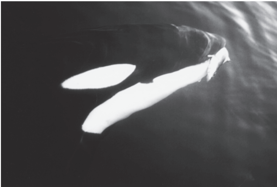
Figure 1. Killer whale ( Orcinus orca ) with school shark ( Galeorhinus galeus ) just below the surface.