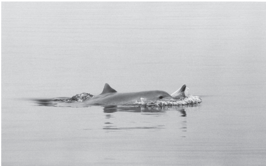
Figure 2. An adult marine tucuxi carries a dead calf in Cananéia estuarine waters, São Paulo.

was observed from land carrying a dead calf (Fig. 2). The calf's carcass tended to float even when not supported by the adult dolphin. Whenever any boat approached both dolphins, the adult would dive for up to 2 min, holding the calf in its mouth, and carrying it about 10 to 20 m away from the boats. In response to the boat approaching, tail slaps and breaches also were observed. On some occasions, the adult dolphin pulled the dead calf under water with its rostrum or the ventral part of its body. The adult dolphin slapped its fluke and breached on two different occasions when two local tucuxi subgroups composed of four and eight individuals approached the pair. After 2 h observing the encounter, three of the authors (MCOS, SS, and ANZ) retrieved the calf carcass. The adult dolphin kept a distance of approximately 5 to 10 m, and a few minutes later it left the area. The calf was a 127-cm long female weighing 32 kg. Fresh tooth marks attributed to S. fluviatilis were found on various parts of the calf's body. No external visible signs of trauma, cuts, or abrasions were evident. Its cause of death could not be determined. Analysis of stomach contents revealed only liquid remains.