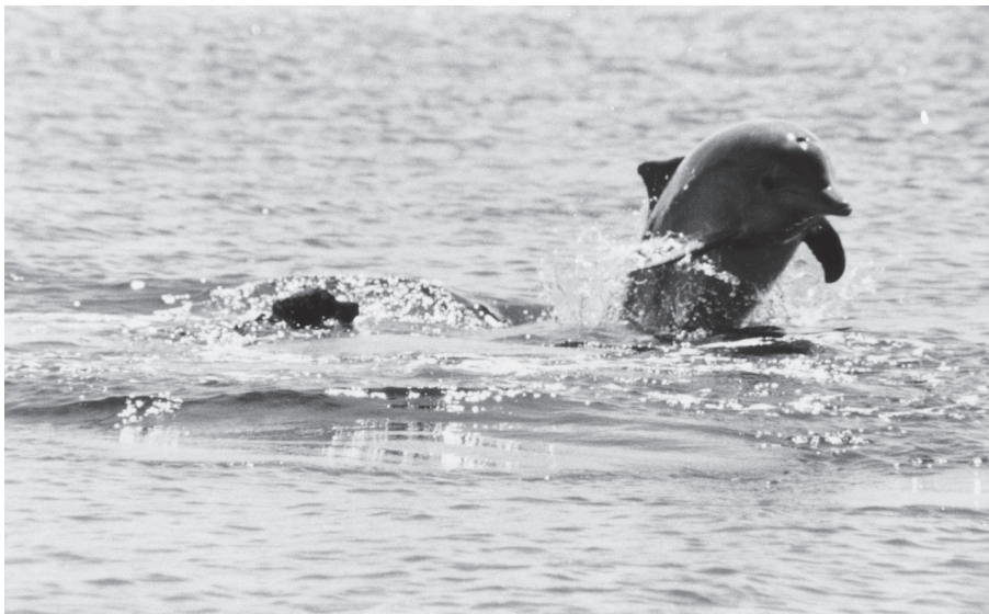
Figure 5. Breaches were common during dog-dolphin interactions in the Cananéia Estuary.