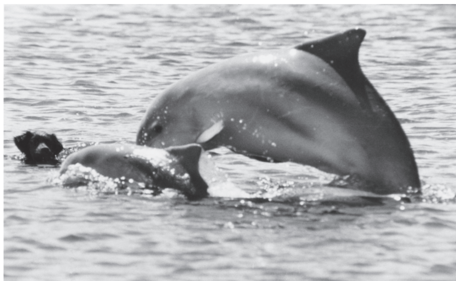
Figure 4. An adult female marine tucuxi trying to avoid closer encounters between its calf and a dog that often interacted with local dolphins at Itacuruçá beach, near the Cananéia Estuary entrance.

(Fig. 4). Adult dolphins would closely approach the dogs, sometimes stopping beside or underneath them. Breaches close to the dogs also were observed (Fig. 5). This interaction lasted approximately 2 h, after which the dolphins first left the area, then the dogs came out of the water. At the end of 1998, one of the dogs died from rabies. During the 1998–1999 summer, the other dog was removed from the Itacuruçá beach to avoid problems with tourists that came to see the dog-dolphin interactions