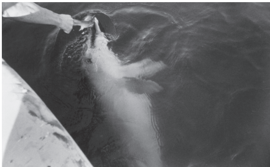
Figure 3. Female marine tucuxi receiving a fresh, live mullet ( Mugil spp.) from the hand of a fisherman in the Cananéia estuary.