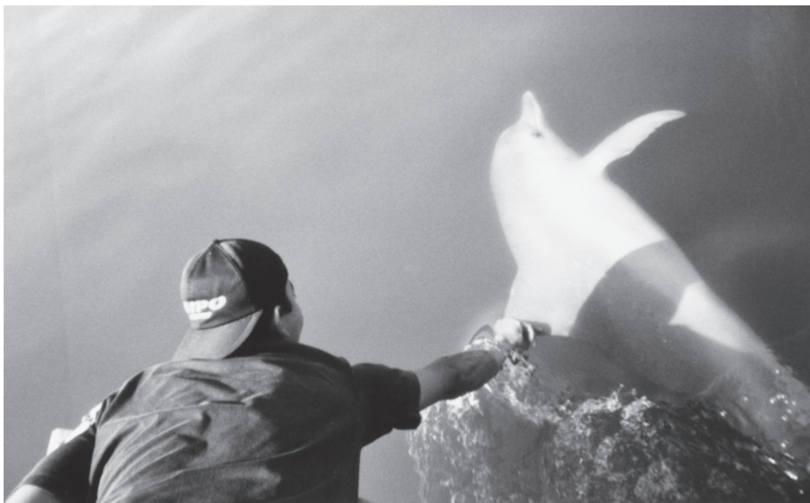
Figure 6. The lone sociable tucuxi allowed to be petted, even when approached by small motor-powered boats.

tourists to swim with the dolphin. The dolphin was readily recognized by its distinct dorsal fin, a deep notch in its caudal peduncle, and some tooth rakes along its body. Local fishermen described that the dolphin was first sighted in November 1997 with a larger individual, most probably its mother. At the end of 1997, the larger tucuxi was harpooned and killed by a local fisherman. After that incident, the smaller dolphin began to approach local boats on a daily basis. This tucuxi had a special affinity for a